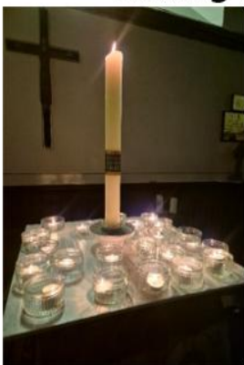
Candles lit during Taizé worship at St Serf's

What is Taizé worship? It is a reflective style of worship, which we enter and leave in silence. Taizé music emphasizes simple phrases, usually lines from Psalms or other pieces of scripture, repeated and sometimes sung in canon. But Taizé worship is more than music. Scripture, prayer, and silence come together in the Taizé experience to create a simple, deep encounter with God. As part of the service, you may light a candle.