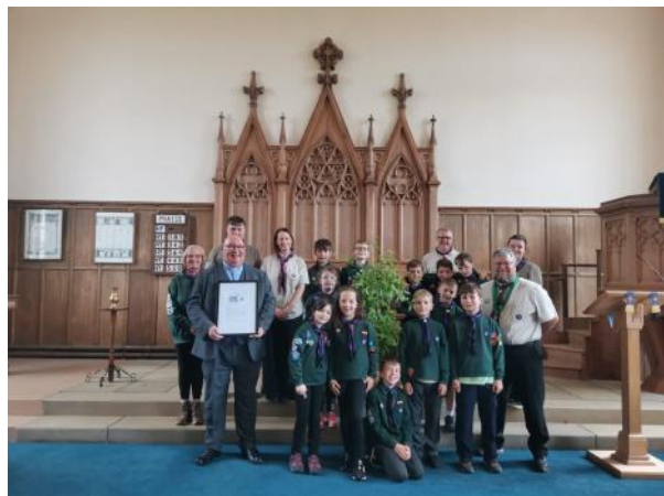
the girls and boys of the 21st Kilmarnock Scouts

The East Fife Rural congregation at Kilrenny Church were delighted to welcome the Cub Scouts from the 21st Kilmarnock unit for their annual weekend camp in the East Neuk. As this was their 40th year visiting the area and staying in Church Halls, they presented the congregation with a plaque and a Kilmarnock Willow Tree to be planted in a suitable spot. The congregation look forward to many more years hosting the Cubs.