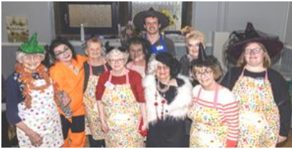
The Olive Branch volunteers dress for Halloween

The Olive Branch is closed from 11 th December to 8 th January.