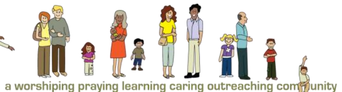
a worshipping praying learning caring outreaching community