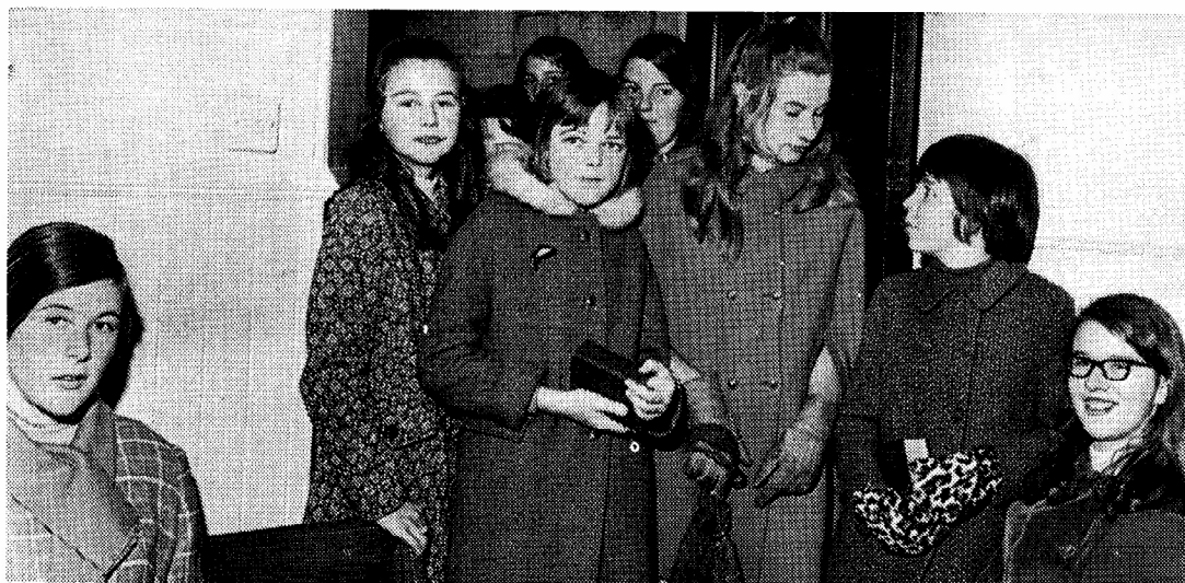
The original gallery room which housed 15 is now overcrowded and newcomers have to queue to crowd in.